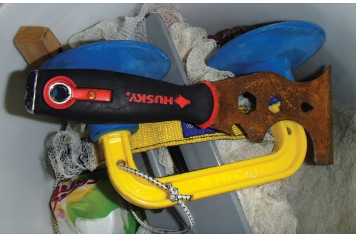
Above, an underwater scraping kit with a scraping tool and suction cup handle (see below) for holding position underwater. Below right, a Pik Stik bilge grabber tool.