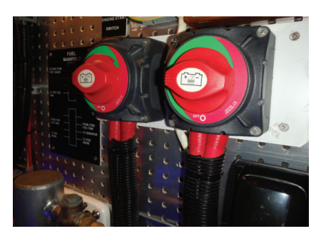
Make sure your battery selector switches are set properly for the situation, whether it be charging the house bank or the engine start batteries.

taken for granted, but it's a good idea to understand where the breakers are. Land breakers are typically easy to find on the dock shore power tower, but aboard your trawler they may be hidden in a locker. If you trip your onboard shore power circuit breaker you will cut off the dock supply until you reset the breaker (sometimes both shore and onboard need to be reset). Knowing where your onboard shore power circuit breaker is and knowing how to reset it is something you should be familiar with. I like to put a label "UP is ON" on the breaker as a quick reference