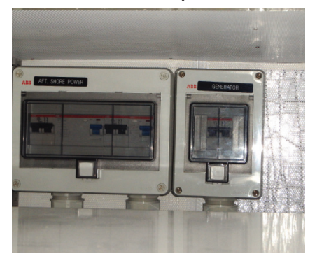
Shore power and generator breaker boxes located in the engine room of a power voyager.

taken for granted, but it's a good idea to understand where the breakers are. Land breakers are typically easy to find on the dock shore power tower, but aboard your trawler they may be hidden in a locker. If you trip your onboard shore power circuit breaker you will cut off the dock supply until you reset the breaker (sometimes both shore and onboard need to be reset). Knowing where your onboard shore power circuit breaker is and knowing how to reset it is something you should be familiar with. I like to put a label "UP is ON" on the breaker as a quick reference