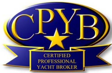
Jeff Merrill, CPYB

Mobile phone: +1 949.355.4950 – call or text