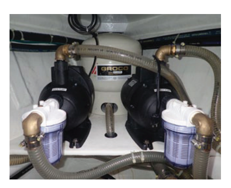
Two fresh water pumps adds redundancy.

Cruisers who travel remotely know that watermakers provide the ultimate independence. On larger trawlers, it is becoming more and more