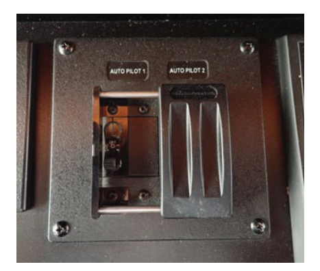
Perhaps twin autopilots are not necessary for short coastal hops, but they can come in handy in case of failure on offshore trips.

Steering by hand is incredibly tiring on a long passage. Nearly all cruisers rely on their autopilot to do this task. What if your autopilot fails? Having two autopilots is a smart move. I know many trawler owners with two pilots who will configure the parameters for the two most common sea conditions: running uphill into the seas and running downhill with following seas. Write down the settings or record them digitally so you can quickly reset one pilot if the other fails. Do you have an emergency tiller? What if you lose all of your hydraulic oil? How will you steer your emergency tiller? Welding