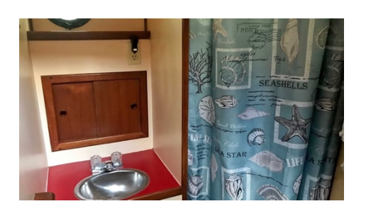
Jeff Merrill Yacht Sales, Inc. © 2019 All Rights Reserved www.JMYS.com