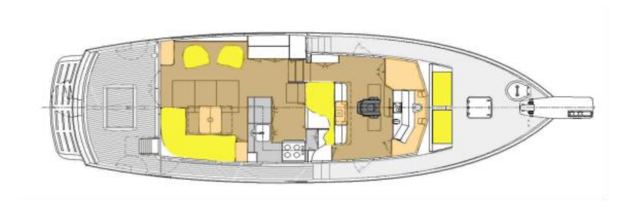
LAYOUT: Staterooms and head