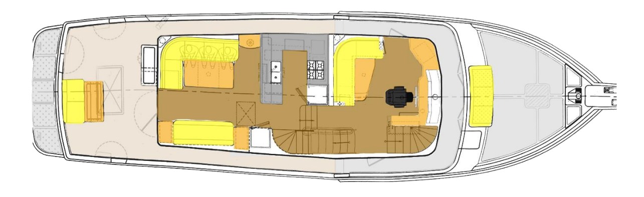
LAYOUT: Lower Deck – Engine Room, Staterooms, Heads