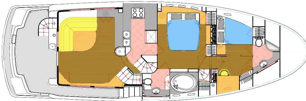
Lower deck layout