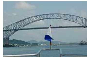
Passing Bridge of Americas

Large ocean going commercial freighters and tankers pass by Nordhavns at sea (hopefully with a few miles in between as recorded on the CPA –closest possible approach), but as shorelines come into view the pleasure and commercial traffic begin to merge together. One of the most famous boating funnels in the world and the best known “short cut” for US sailors is the famous Panama Canal. Built in the early 20th century it is one of the marvels of the modern world and if you want a fun research project (that will hopefully be relevant in your future cruising lifestyle), take some time to read up on it. I strongly recommend David McCullough’s book, The Path Between the Seas .