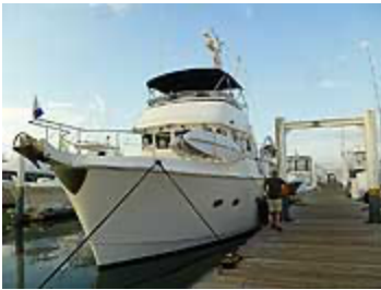
Ready to Go

Nordhavns are designed to see the world, to travel across enormous bodies of water and safely deliver their crew to distant landfalls. Often times the only “company” on desolate waters are sea birds and freighters.