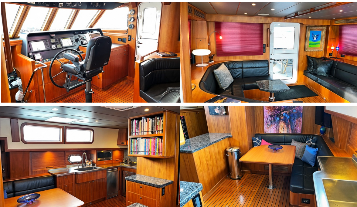
LAYOUT: Upper Level – Aft Deck and Saloon/Pilothouse: